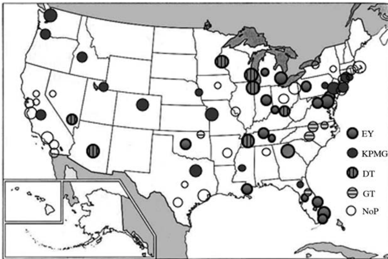
Figure 3 Purchasers of Andersen offices in 2002

The variables are defined for each Andersen office location ( j ) and potential acquiring audit firm ( k ) and are discussed in the following paragraphs. F is the