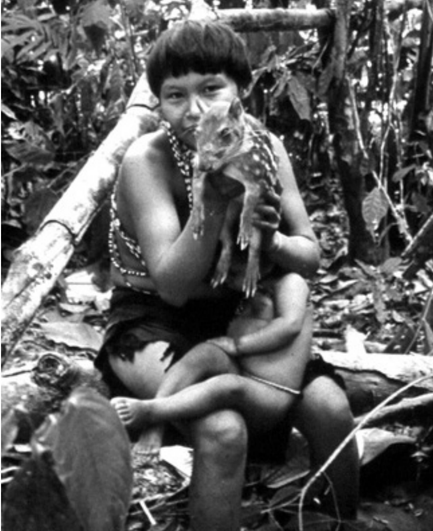
Figure 2. A woman hunter holds the akuli ( Agouti paca ) that she captured while hunting and caring for her son

Some accomplished female hunters stated that their mothers hunted with blowguns and introduced them to the art of hunting while on such outings. Most female hunters own both blowguns and spears. Many women initiate their children into the knowledge of hunting and animal behavior. In the ontological myth that tells why manioc is not a primordial food for the Joti, one of the key characters, uli yewi ayn (“jaguar’s female companion”), a brave and skilled female hunter, saves humankind from being eaten by the jaguar. However, despite the distinctive role of “woman the hunter” in