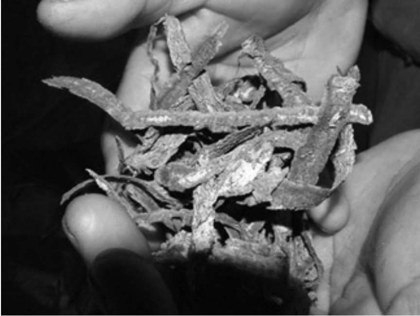
Figure 8. The bark of a tree ready to be prepared and used as hunting magic by a hunter

The latter may entail the hunter cutting his tongue with the coarse leaf of nin jani wejkaō ( Pourouma spp.) or with a young branch of ili kwe jyei ( Ormosia sp.), and then letting the blood drip onto the jkyo waña yakino or onto the entrance of some poisonous insect's nest (e.g., a bullet ant ( ineyodī ) or "24-ant" (a big, strong, hard, black ant so-called because it produces a twenty-four hour fever if it stings); a big black ant ( uli inedi ); a tiny red stinging ant ( imo ); a black army ant ( jyō ); a scorpion ( ijti ); et cetera). In the case of improper handling of the waña , the blood should cover the jkyo waña so the hunter recuperates his abilities and connectivity with the natural spheres. The lethal power and strength embodied in the poison of the insect is transferred to the hunter, thereby dispelling their weaknesses and enhancing their strengths. The pain produced through this procedure acts as a catalyzer that transmits the tree's substance and the insect's poisonous qualities to the hunter. Attribute transferences also occur when a scorpion or other insect with a stinger ( anene yede )—such as wasps ( mu jadi ) or urticating caterpillars ( wejtowa jadi )—is burned and the hunter smears his face with the ashes it produces. The poison of scorpions and some snakes is similarly effective after it is extracted, mixed with water, and introduced into the nose. The scorpion was once a great human hunter in the ontological myth that explains its