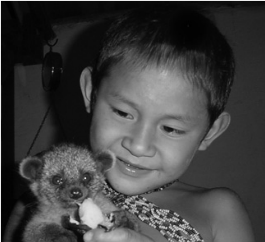
Figure 12. Boy holding a juvenile jmujkelo ( Potos flavus )

channel to transmit and transfer properties and essences. Furthermore, a hunter's body paint is the physical manifestation of the hunter's volition, announcing the objectification of the prey (cf. Viveiros de Castro 1998).