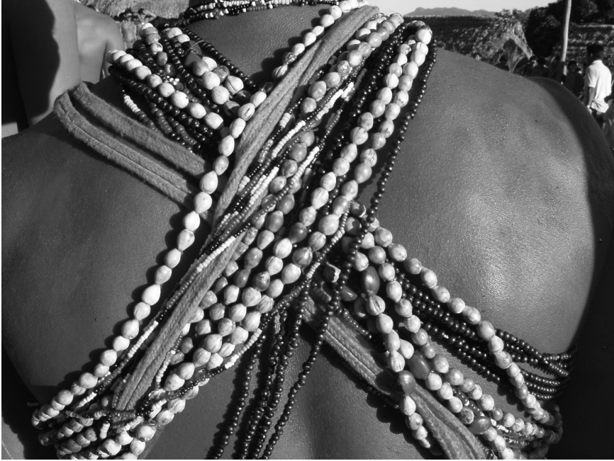
Figure 5. Corporeal adornment of strung beads