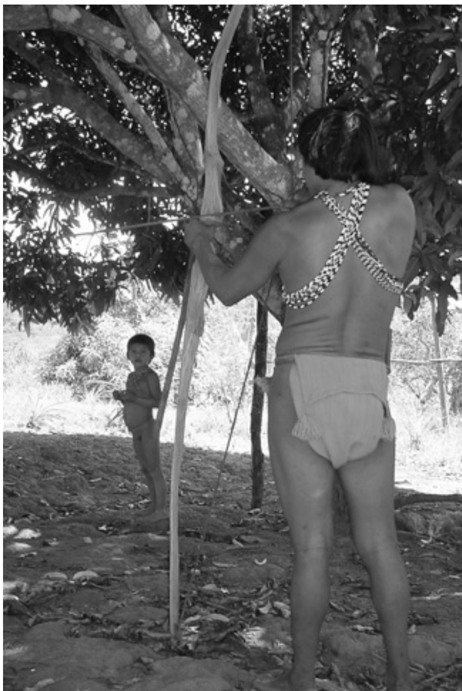
Figure 10. A Joti man with bow and arrow