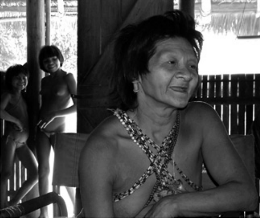
Figure 3. A woman narrates stories of her hunting trips