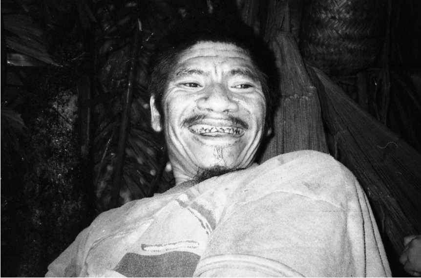
Figure 3: Kučo

who feel that they too have long-standing claims to the territory and are not threatened by Kučo's presence.