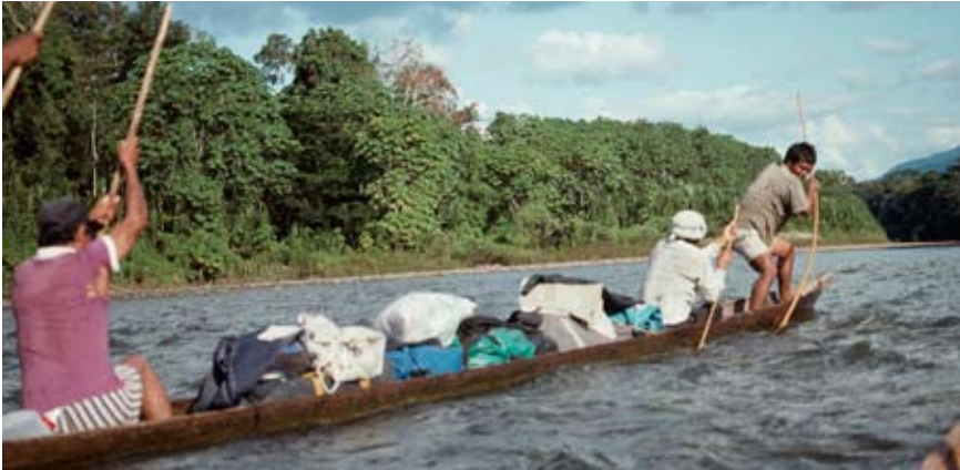
Figure 4. Poling up the Pisqui in a dugout canoe

the summit of the highest peak visible from Nuevo Eden, “Mananshua Manān” (Turtle Mountain) is 1,434 meters, whereas the elevation of Nuevo Eden is about 260 meters above sea level.