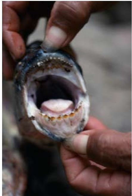
Figure 11. A seriously carnivorous fish

About two kilometers above our camp, we came to a series of extremely difficult passages involving large boulders, waterfalls, and deep pools. The river made a sharp bend upriver to the west, and it was obvious that there were periodic flash floods with depths of ten to twenty meters. Just below a narrow trench through which the river flowed, the men left me to fish while they explored ahead to look for a place to camp for the night. Although I had brought wire leader, I found myself struggling to haul in large trout (fifty to sixty centimeters) with large, sharp teeth. Some of them bit right through the steel leader. There were large schools and several species of fish, some of them sharp-spined catfish.