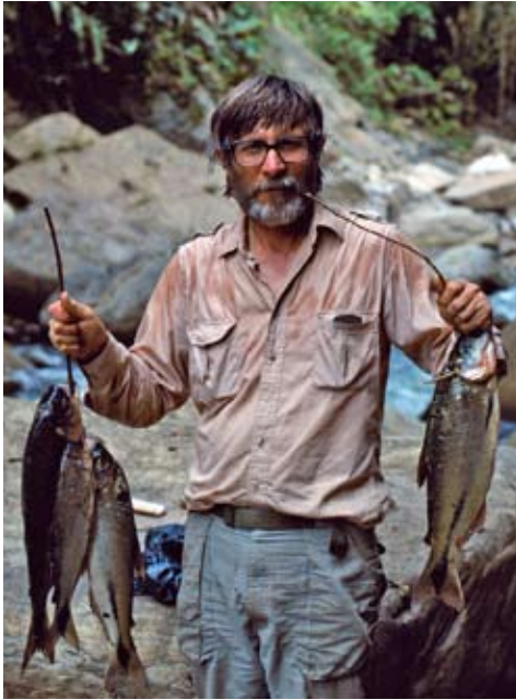
Figure 14. Author with a good catch for the afternoon on upper Huiñ Caibima

water. When they returned to the camp, they said it was impossible to go further. The south bank, on which we were perched for the night, looked to be sheer rock cliffs for some ways up the valley. That night, Benjamin assigned one person in rotating shifts to watch for jaguars coming into the camp since we could not hear anything over the roar of the water.