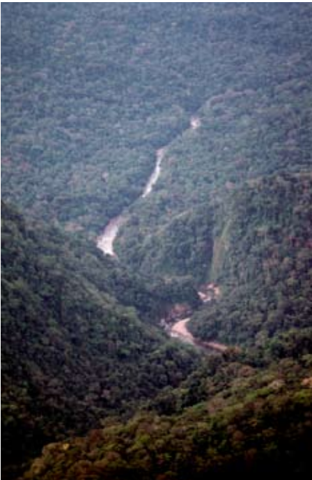
Figure 8. Headwaters of Pisqui at the crossing to Huiān Caibima

None of my Shipibo friends had ever seen a map, so they could not interpret the materials I had. At each point on our trek up the river from our base camp, I had followed the topographic map and had taken bearings