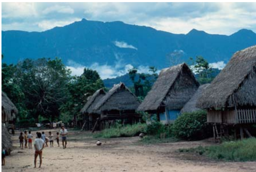
Figure 3. The village of Nuevo Eden with Mananshua Manān in the distance. Village location: 8° 25' 57.80" S, 75° 43' 43.2"W c 260 m

The first stop on the journey was the village of Nuevo Eden, where, on several occasions from 1984, I had worked as a physician and epidemiologist conducting ethnographic and demographic research (Hern 1992a, 1992b, 1992c). Nuevo Eden is located about twenty kilometers from the base of a spectacular mountain range, the Cordillera Azul, which rises abruptly from the western edge of the Peruvian Amazon. According to topographic maps and my transit measurements,