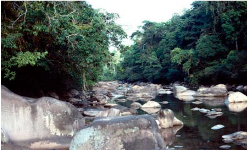
Figure 15. Upper Pisqui, main channel, August dry season