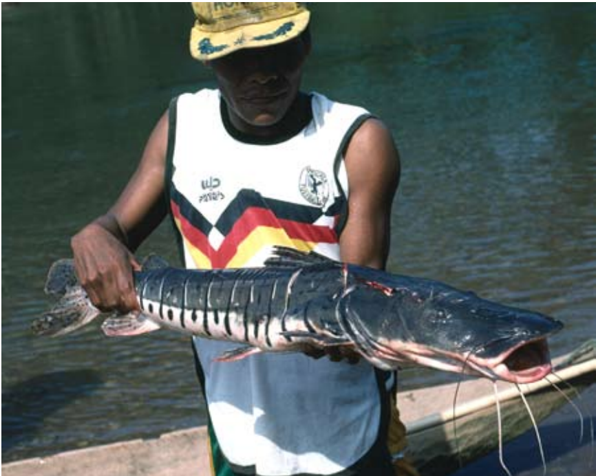
Figure 7. A crew member holding an ino buabuin (tiger catfish) that he speared

Just before reaching our last upper Pisqui campsite at the crossing point, I faced a possible mutiny when I discovered that the crew had shot a maquisapa (black spider monkey) against my instructions not to kill the animals unless necessary for self-defense. They had encountered an aggressive and threatening tapir with no fear of humans on an earlier trip without me and had resorted to killing it with stones because the shotgun did not work. This time, though, there was no real danger. There was plenty to eat, because I had paid for and brought provisions, and we were leaving uneaten fish behind. The dead maquisapa hung on a branch high in the tree and the crew was going to cut down the tree to get it so they could eat it. “Nope,” I said, “I’m paying for the ammunition and this is against the rules. Leave the monkey.” Their obvious, sullen anger made