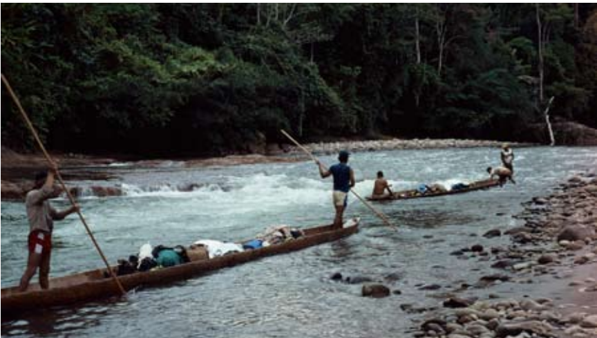
Figure 10. Poling up rapids on Pisqui, second expedition (1992)

The next year, I organized another expedition with the intention of exploring Huiñ Caibima. I wanted to see if we could use my original plan of following the creek up the drainage until we could climb the low pass separating that drainage from the valley in which we knew Tashi Manñ to be. I hired a missionary pilot to fly me and my expedition gear into Nuevo Eden. My crew with my boat (a dugout canoe with a roof) was to come up the lower Pisqui and meet me at Nuevo Eden. Part of my crew would go up the Pisqui from Nuevo Eden with me.