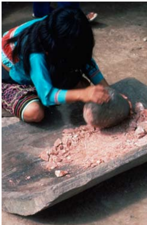
Figure 2. Grinding salt from Tashi Manān

contact. The Shipibo informed me that their ancestors had managed a brisk trade in salt, stones (unavailable on the Ucayali flood plain), and certain clays used for painting.