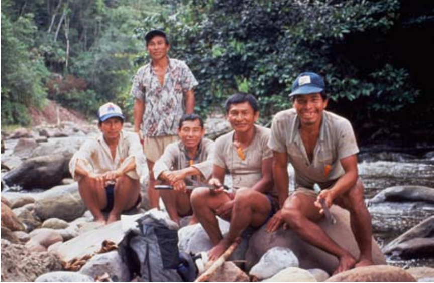
Figure 9. My crew on the day of discovery of Huiñ Caibima

The next year, I organized another expedition with the intention of exploring Huiñ Caibima. I wanted to see if we could use my original plan of following the creek up the drainage until we could climb the low pass separating that drainage from the valley in which we knew Tashi Manñ to be. I hired a missionary pilot to fly me and my expedition gear into Nuevo Eden. My crew with my boat (a dugout canoe with a roof) was to come up the lower Pisqui and meet me at Nuevo Eden. Part of my crew would go up the Pisqui from Nuevo Eden with me.