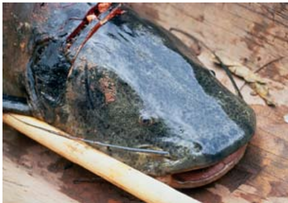
Figure 13. Large catfish caught from upper Pisqui