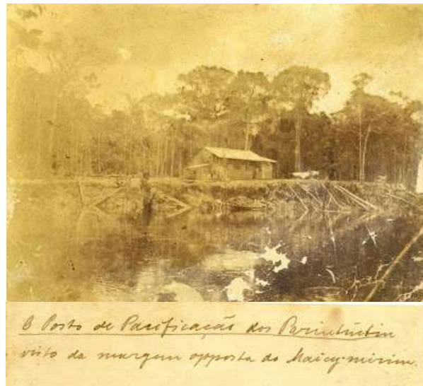
(caption written by Nimuendajú on the back of the photograph)

The collection contains various photographs taken by Curt Nimuendajú, from various periods in his career as a scholar of indigenous culture. The most impressive are those that he took of the Parintintin. For example, the photograph reproduced below of the landmark can clearly be seen to be in a state of disrepair.