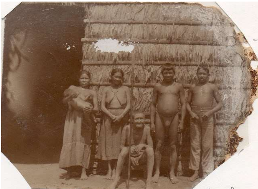
Walipere-dakenai Indians, the old Tuxaua (chief) and family