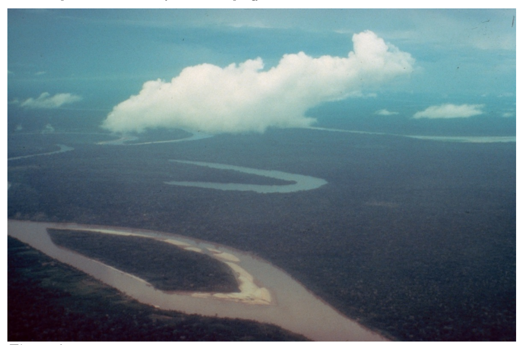
Figure 1. The Ucayali flood plain north of Pucallpa, 1964

As do other Amazonian tribes, the Shipibo have a close familiarity with the plants of the rain forest, and they have identified and use several psychotropic drugs that they obtain from the forest. Principal among these is Banisteriopsis caapi , a liana that is found hanging from various trees. The vine is cut into small pieces and boiled in a cook pot for a day to release the alkaloid within it, which is harmine. The decoction, which has a dark brown appearance, is called "oni:" by the Shipibo. Its more famous name, especially since it has come to the attention of Western explorers, anthropologists, adventurers, and those collecting psychotropic experiences, is "ayahuasca." This Quechua name has been translated variously as "vine of the soul" and "dead man's vine." According to an Ucayali legend, the potion acquired this name because, reportedly, at least one person, whether a native shaman or a gringo, died from ingesting it. Among the Shipibo, it is known (or reputed) that the Shipibo shaman ("muraia:," or "seer") is overcome in the hallucinogenic trance and voyage into the underworld by the "yushin" (devil, or force of death) in the shaman's fight to save or cure the patient.