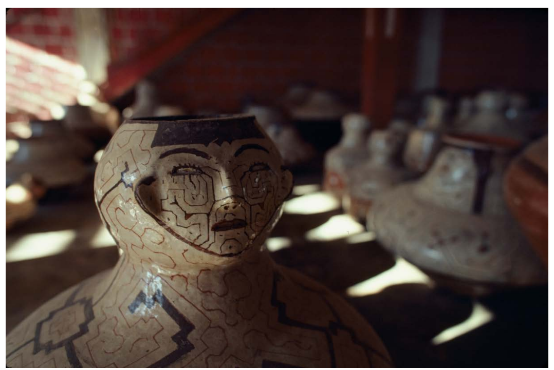
Figure 8. A jonichomo : waiting for sale at the Maroti šobo ("selling house" or trade cooperative) in Yarinacocha