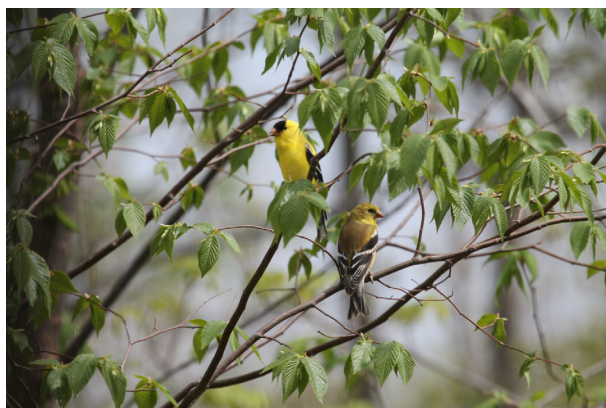
Figure 1. Male (left) and female American goldfinches. Both sexes express carotenoid-based yellow plumage and orange bills during the breeding season. Ornamental plumage is highly sexually dimorphic, whereas ornamental bill color is much less so.

The American goldfinch ( Spinus tristis ; Fig. 1) serves as an excellent species with which to evaluate signaling in relation to parasite infection. They are sexually dimorphic songbirds in which carotenoid-based ornamentation is expressed in males and females. Following the pre-alternate molt that takes place during a roughly 6-week period in March–May, both male and female American goldfinches express patches of carotenoid-based yellow plumage and orange bills. Sexual dichromatism in plumage is pronounced, wherein the yellow plumage patches of males are far larger and tend to be more colorful (brighter, more saturated, and with a hue that is shifted toward longer, more orange, wavelengths; Kelly et al. 2012) than those of females. In contrast, the difference in bill color between the sexes is much less pronounced than