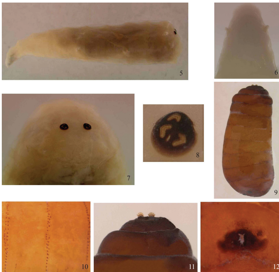
Figs. 5-12. Philornis fasciventris . Fig. 5) larva: general aspect; Fig. 6) larva: anterior end with anterior spiracles; Fig. 7) larva: posterior end; Fig. 8) larva: posterior spiracle and spiracular slits; Fig. 9) puparium: general aspect; Fig. 10) puparium: detail of spicules ; Fig. 11) puparium: anterior end; Fig. 12) puparium: caudal segment, anal region.

spiracles (closer to each other in P. aitkeni , separated by about the width of one spiracle, while in P. fasciventris they are separated by a distance of two spiracles). The arrangement of the spines and the shape of the posterior spiracular slits are also very similar.