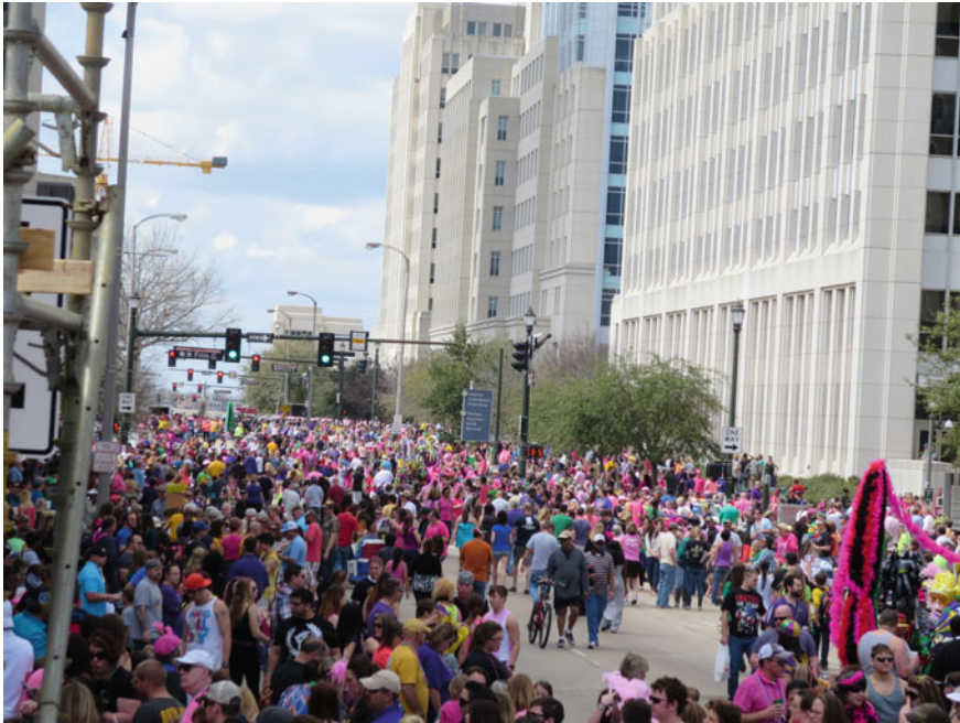
Fig. 6.5 Street view of Spanish Town parade crowd

had become as it became trendy and less connected to its bohemian past. Similarly, the contemporary Spanish Town Parade includes a complicated mix of homophobic sentiments, heterosexual celebration of temporary gender non-conformity, and heterosexual control over the parade organizing.