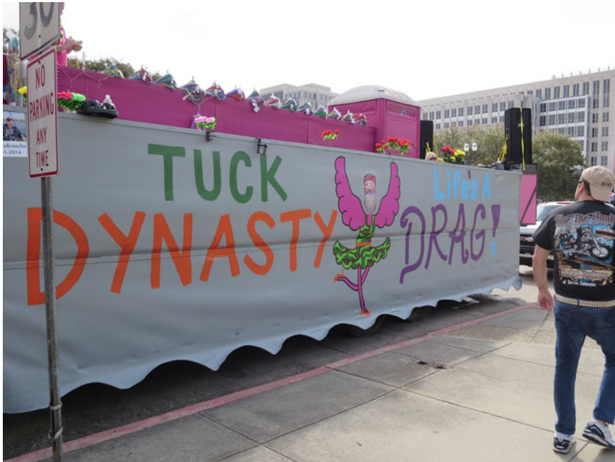
Fig. 6.3 Spanish Town float

parade organizers and participants “argue that the high exposure [of the parade] has sapped the parade of its queer politics” (Bowman et al. 2007: 300). Throughout my fieldnotes I did note the consumption of queer culture and fashion by parade attendees, particularly the attention given to white gay men who were dressed in drag or outrageous costumes. Drag queens who I interviewed remarked that they often got frustrated by being constantly stopped by presumed straight attendees to take group pictures with them.