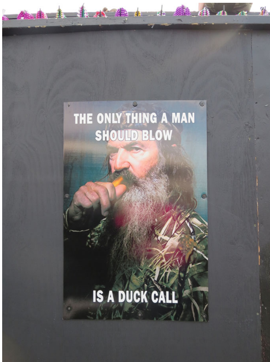
Fig. 6.2 Spanish Town float about Duck Dynasty patriarch

The queer politics of the parade at times seems celebratory and at other times seems a project consumed by heterosexual participants. Elements of the queer origins of the parade are evident in the current event, particularly its anti-family sentiment, cross-dressing, flexibility, and diversity. The continuing ethos of “bad taste” at the event reflects its bohemian origins. Other scholars have suggested that longtime