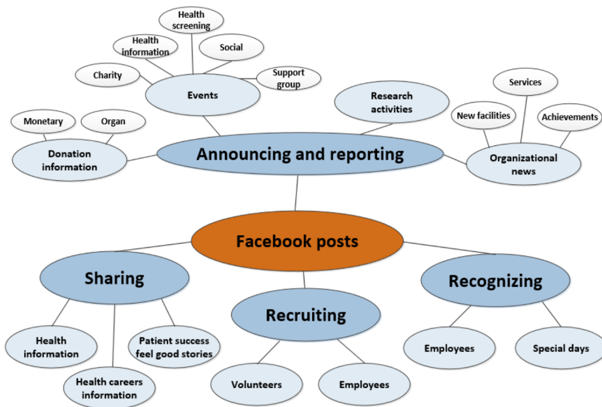
Figure 1. Thematic web of content (phase 1).

We first familiarized ourselves with the sample data and independently generated initial lists of theme codes. We then met, compared our lists, discussed differences, and settled upon an initial set of codes to use when tagging the sampled data elements. In addition, we agreed each researcher could add codes to the list, and we would discuss those additions later. Next, we each independently reviewed each of the sample data elements and inspected any photos or videos included in the post to discern meaning. We then tagged it with up to 3 theme codes believed to be relevant to the post. We met on 2 separate occasions during the coding process to compare our updated lists of theme codes, resolve differences, and discuss the processes we each employed. During the early course of those discussions, we agreed to shift away from applying a strictly semantic lens (word meaning) when analyzing the data elements and toward a more interpretive lens (statement intent) [25]. This was necessary, as intent was not always clearly conveyed in just the post text. For example, the text of one post announced the date and time of an upcoming social event; however, the attached image contained a graphic indicating the event was sponsored by an organization concerned with organ donation. An interpretive lens was necessary to induce meaning from the photo, which ultimately resulted in coding the post as both announcing a social event and promoting organ donation .