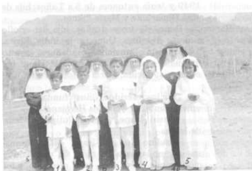
First indigenous children raised in the boarding school at their first communion (1952)(Vegamian 1972: 370)

Separated from their families and traditional forms of production in the artificial environment of the mission boarding school, children from different subgroups were raised together, fed Western foods, and indoctrinated in the Christian faith. The children raised in the boarding school formed a substance group of their own beyond the classical Yukpa subgroups. These new Yukpa were largely unaware of their traditional kinship system and established marriage relations across the subgroups, transgressing thereby traditional subgroup boundaries. At the same time naming, 23 initiation, and seclusion rituals were transformed or substituted by Catholic rites.