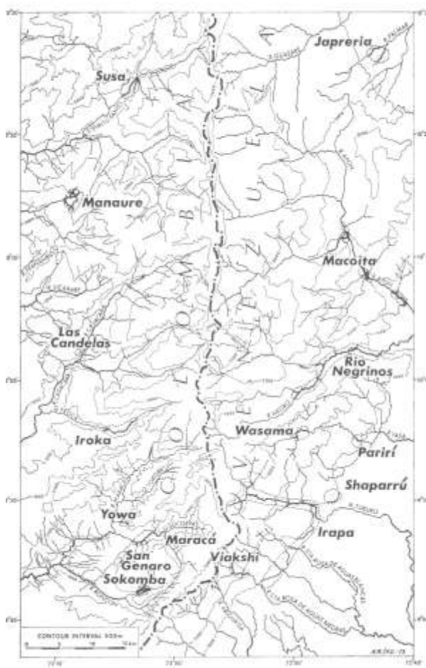
Figure 1. ‘Location of Yukpa Subtribes’ Ruddle (1974: 29)

Wilbert assumed that Yukpa are “all tribes in the region of the Colombian and the Venezuelan Sierra de Perijá, between the Rio Palmar in the North and the Rio Tucuco in the South” (1960: 116f). While arguing for the existence of different tribes in the 1960s, Ruddle and Wilbert (Ruddle 1971, 1974, Ruddle and Wilbert 1983) later conceptualized one Yukpa “tribe” divided in 16 “sub-tribes”. This image has served as the background for anthropological studies ever since. The different “sub-tribes” were conceived as endogamous (Wilbert 1960: 117, 1974: 78, 83; Ruddle and Wilbert 1983: 38f.) and as lacking overarching peaceful social relations, because “traditionally, each of the subtribes has occupied a distinct territory focusing upon a particular river valley” (Ruddle 1971: 24; 1974: 28). They were understood as “independent, politically autonomous, largely endogamous bands, which, until recently, have lived in a state of almost perpetual hostility toward each other” (Ruddle 1974: 33, see also Layrisse, Layrisse and Wilbert 1960: 422, Wilbert 1961: 16).