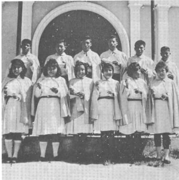
First class to finish missionary primary school (1965)

The Yukpa of the mountains are engaged in hunting and shifting cultivation, activities that establish relations with the world as understood in their non-Christianized conception of the world. These Yukpa argue that those in the mission will die young and get old early because of these incestuous relations, because of the watia ’s food, and because they share food and sexual relations indiscriminately, disrespecting necessary avoidances.