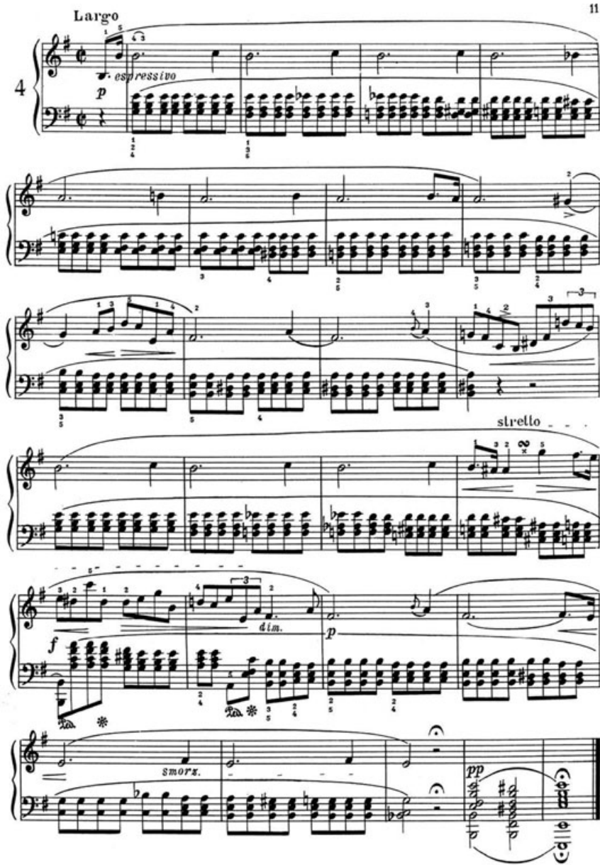
FIGURE 2. Chopin, Prelude in E minor, op. 28/4. Public domain, accessed at http://imslp.org/wiki/Preludes,_Op.28_(Chopin,_Fr%C3%A9d%C3%A9ric) .

First, Chopin’s left and right hands have been switched in Beaudoin’s work, meaning that the melody is now below the accompaniment. This is inspired by the fact that Talbot’s Latticed Window is a photographic negative. Whereas light and dark are reversed in Talbot’s image, in Beaudoin’s