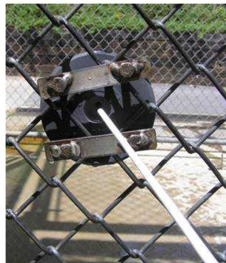
Figure 1. Photograph of a chimpanzee using a lollipop stick as a tool to retrieve food from the simulated termite fishing device.