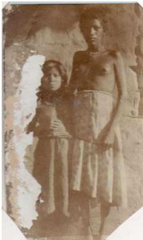
River Içana. Mapanaí people. Yandu hut