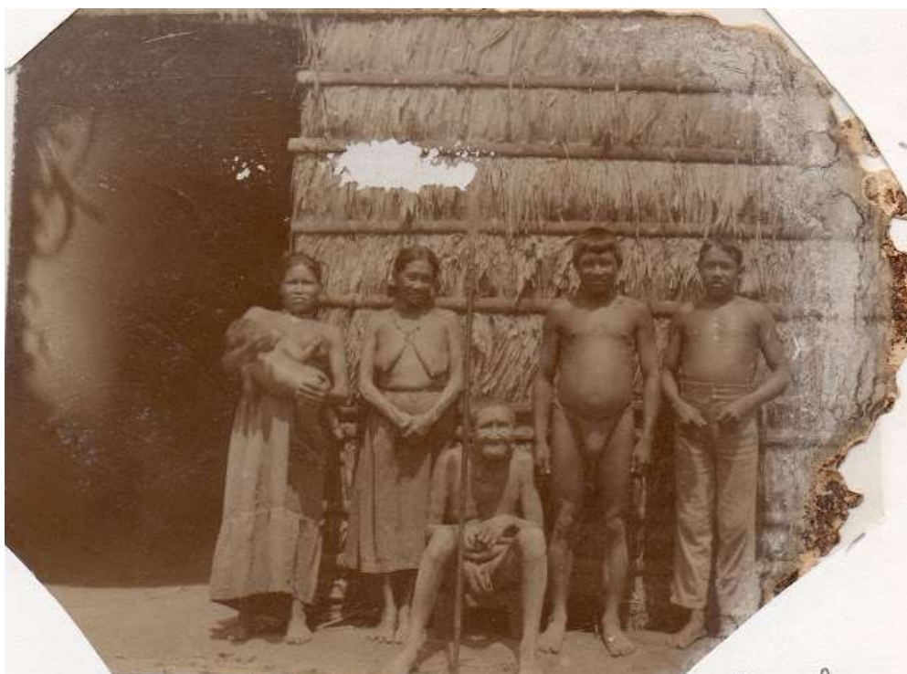
Walipere-dakenai Indians, the old Tuxaua (chief) and family