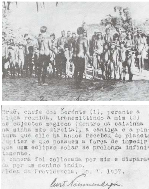
Front and back of Nimuendajú photograph of the Xerente, 1937