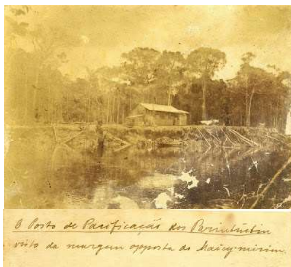
(caption written by Nimuendajú on the back of the photograph)

The collection contains various photographs taken by Curt Nimuendajú, from various periods in his career as a scholar of indigenous culture. The most impressive are those that he took of the Parintintin. For example, the photograph reproduced below of the landmark can clearly be seen to be in a state of disrepair.