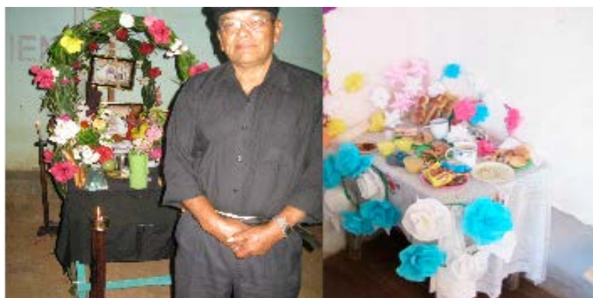
Figure 2. Altars for the dead: black for adults and white for young dead infants ( angelitos ).

There are indeed two gaps or hiatuses between the biological and social birth and death. Through nutritive substances and during ritual practices, human beings participate actively in the growth of this vital force which animates the individual and illustrates the gap between social and biological life. The social birth takes place approximately three years after the biological birth and social death occurs three years after biological death. Thus, there is symmetry between biological life/social life and biological death/social death.