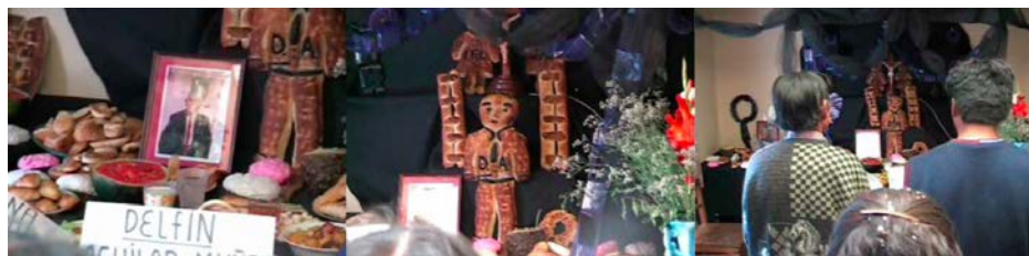
Figure 3. Fabrication of the dead.