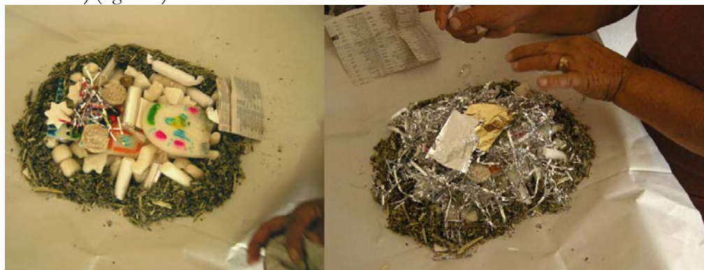
Figure 5. Wira kboa : a fat based table. (Ferrié)

Wira kboa or wira q'uwa ( Senecio mathewsii WEDD) is an herbaceous shrub of the altiplano which grows around 4.000 meters high. This plant is ritually important because it constitutes the base layer of the offering tables in Apolo, like in the Andes or among the Kallawaya, it has a pleasant fragrance released in the smoke during cremation ceremonies (Girault 1984:487 for the plant description and 1984: 556; 559; 589 for the ritual uses) (figure 5).