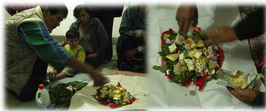
Figure 6. Ritual table ( mesa ) activations. (Ferrié)

Both animal and plant fat are important for assuring growth, which means all fats have a central place in rituals. On the ritual tables, it is a major substance in assuring that the non-visible entities are propitiated.