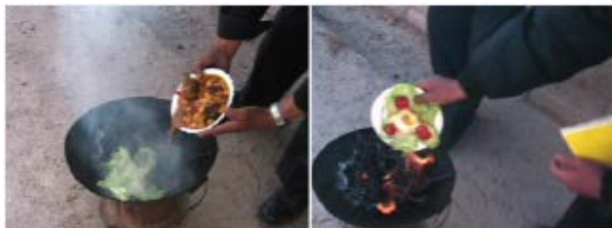
Figure 4. Feeding the dead with fat: lunch through sami (Ferrié).

Prayers summon the deceased and offerings of food are given to their alma . The living eat for the almas : food, coca and tobacco play a role in the “transformation from the living into the dead” as much as tobacco and rum for the Chachi (Praet 2005:137). But the alma drink and eat in their own way: the living pour a dish of food on smoldering embers to feed the alma because the smoky fumes, with their condensed flavor, is how alma absorb their food. The alma eats through sami : “the life force [which] can be transmitted from one living thing to another” (Catherine Allen 1988:207, who also compared sami to the concept of mana ) (Figure 4).