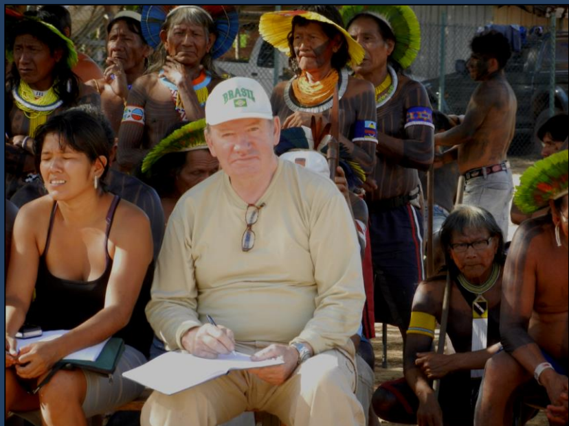
Piaraçu meeting