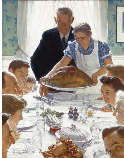
Freedom from Want , Norman Rockwell.